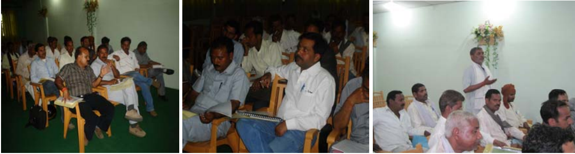
Open dialogue and discussion