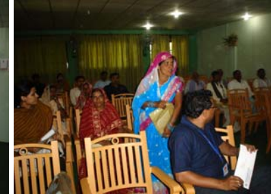
Welcome and introduction