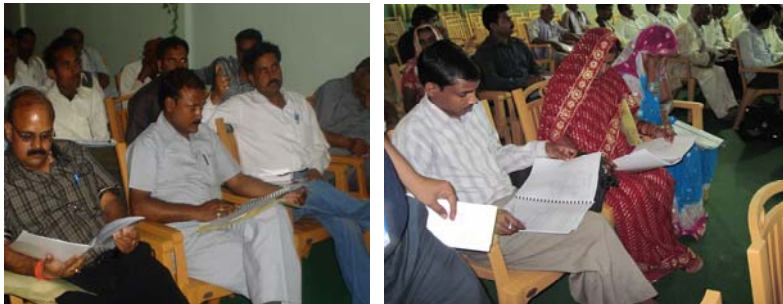
Participants going through training modules