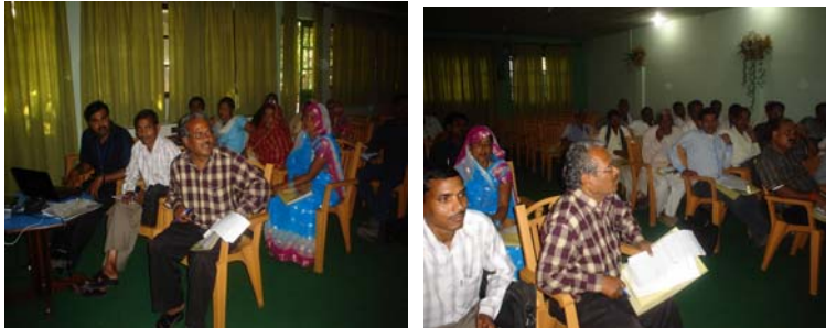
A government official with his suggestions