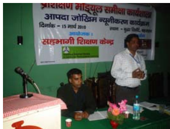
Vote of thanks