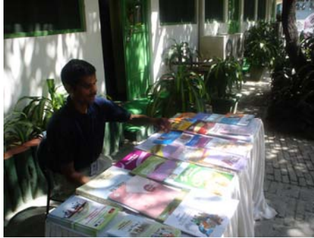
At the Buddha Resort, Behraich