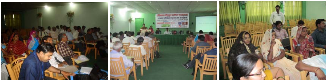
Everybody in participation mood